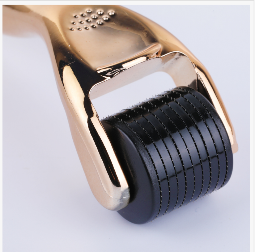
High quality titanium needles

The DermRoller has even been reported to significantly improve hair loss in men and women by