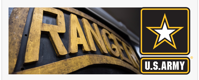
U.S. Army Ranger, Elite Large-Scale Special Operations

Dedicated to service, committed to excellence