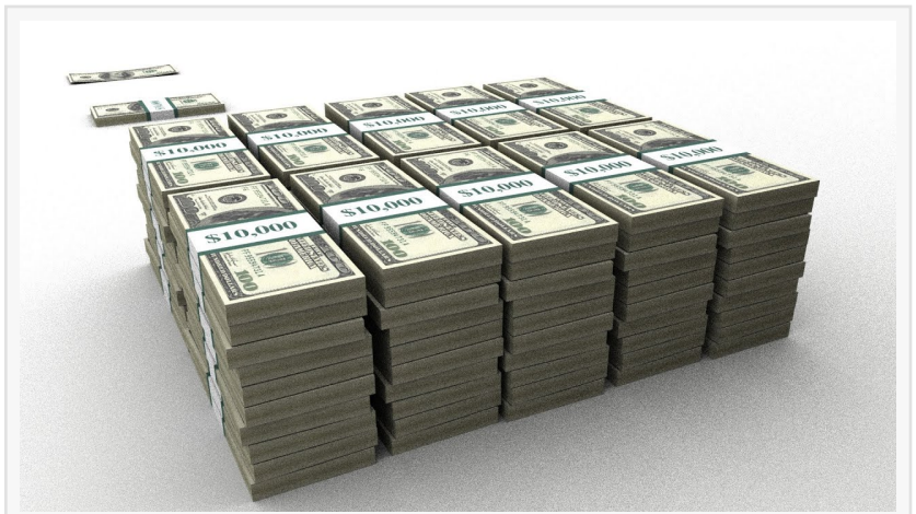
BIG SALES - HOT LEADS

Sprint Data Solutions Worldwide Marketing is, first and foremost, in the business of creating databases and putting them to good use for clients in all fields around the nation. Creating Sales Leads that are unique and exclusive tool available only from Sprint Data Solutions Worldwide Marketing The company was established even before digital marketing took to the stage, first entering the field of postal mail marketing. The team helped clients find the customers they were looking for by providing lists broken down into specific categories such as age and interest that brought higher response rates when properly applied.