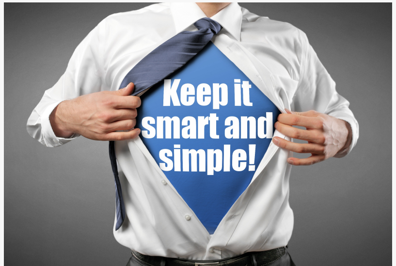
Response Driven Sales Leads

Sprint Data Solutions Worldwide Marketing is a disabled veteran owned and operated company that aims to help various business owners grow their operations with mailing lists. The company started in Las Vegas, Nevada, and its staff has over 50 years of combined experience within the