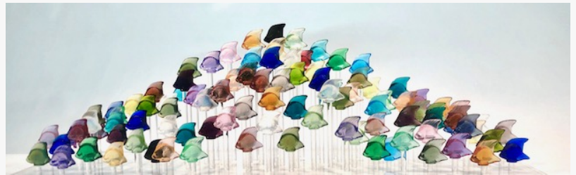
Lalique clear and frosted and colored glass aquarium comprising 100 fish, each etched Lalique® France, on a stand and contained in a plexiglass box, each fish 2 inches tall (est. $3,000-$5,000).