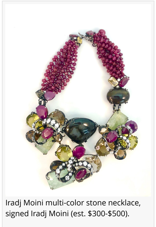
Iradj Moini multi-color stone necklace, signed Iradj Moini (est. $300-$500).

This press release can be viewed online at: https://www.einpresswire.com/article/518091739