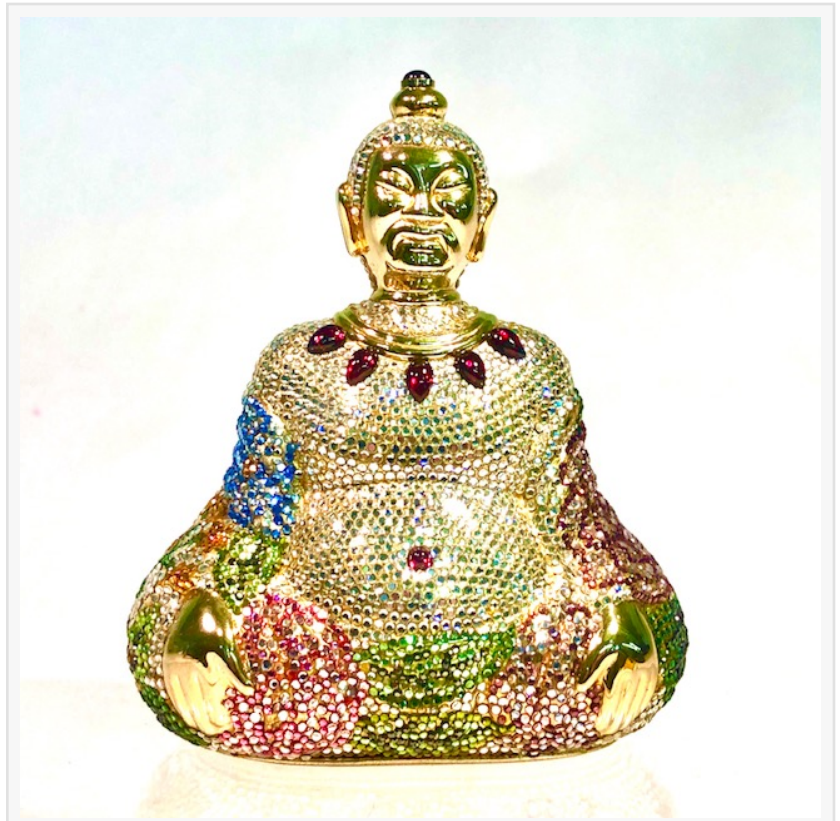
Judith Lieber Buddha minaudière, the interior lined in metallic leather, with tuck away gold tone shoulder chain, comb and mirror, and applied factory label, 5 ½ inches tall (est. $800-$1,200).

Aileen Ward Andrew Jones Auctions +1 213-748-8008 email us here