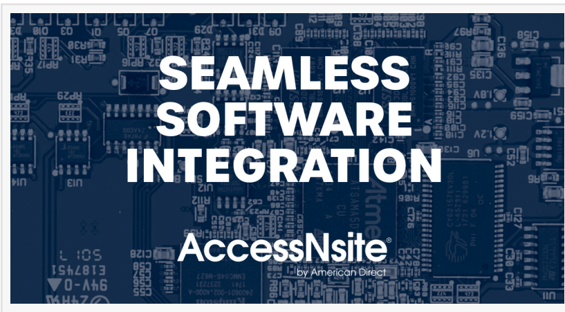
Seamless Software Integration

LENEXA, KS, UNITED STATES, May 28, 2020 /EINPresswire.com/ -- Ensuring people and property are safe begins with access to your facilities. Technology has transformed the physical key into a digital credential. American Direct offers a completely integrated solution at the door opening and beyond. Providing solutions as simple as door hardware installation