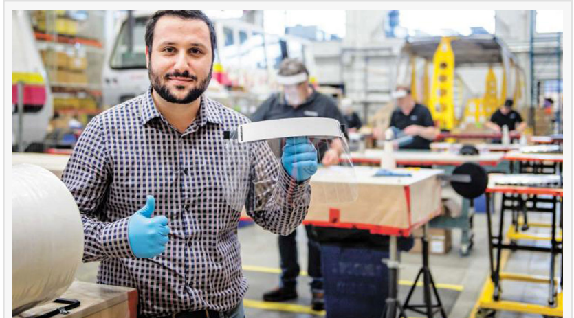
BOMBARDIER celebrates face guard production using SPEEDWRAP Hook & Loop Fasteners

RACINE, WISCONSIN, UNITED STATES, June 2, 2020 /EINPresswire.com/ -- Speedtech International is supporting Fastenal to supply custom Hook & Loop SPEEDWRAP® Brand Fasteners for use with face shields for Medical Professionals manufactured at Bombardier Transit.