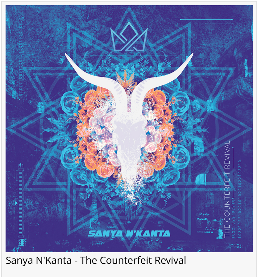
Sanya N'Kanta - The Counterfeit Revival

This press release can be viewed online at: https://www.einpresswire.com/article/518178982