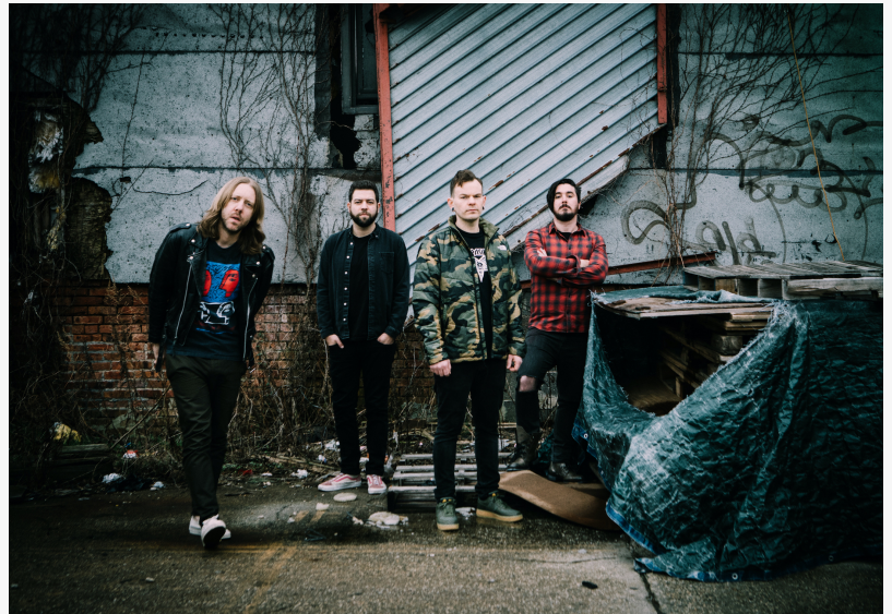
Sun & Flesh