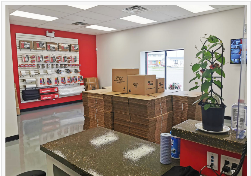
Apple Self Storage Office with Moving Supplies