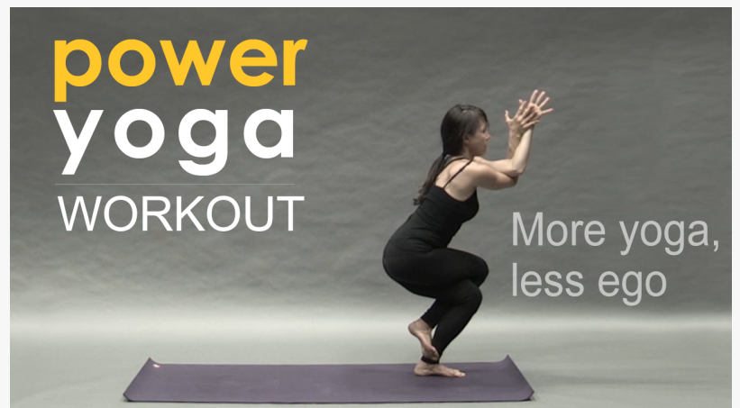
Power Yoga Workout

NEWPORT BEACH, CA, UNITED STATES, June 2, 2020 /EINPresswire.com/ -- Heart Alchemy Yoga YouTube channel has released a new video to the Power Yoga Workout series, an all-time favorite of America's yogis, which lately has become the most requested due to/since the quarantine situation where many people are opting for an energetic but home-friendly workout.