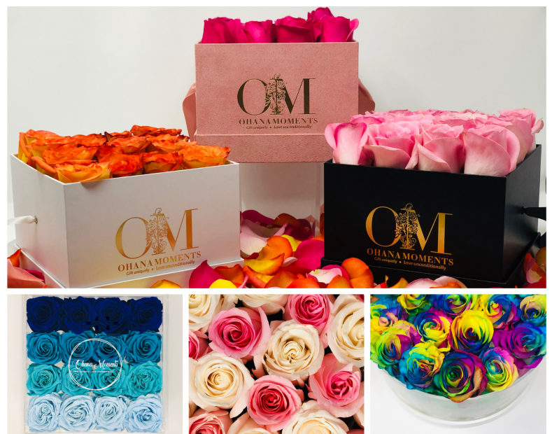
Ohana Moments Collections