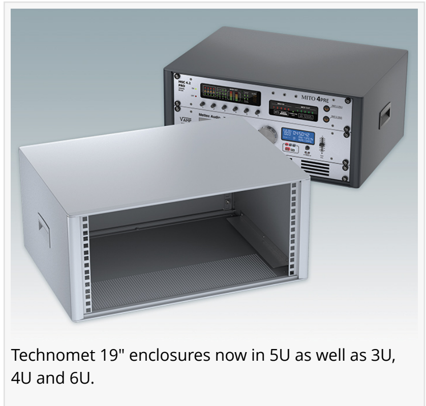
Technomet 19" enclosures now in 5U as well as 3U, 4U and 6U.

These advanced mini-racks are designed for mounting standard 19" subracks, chassis and front panels. Applications include test and measurement equipment, networking and communications devices, sound and studio systems, laboratory instruments, industrial computers and control systems.