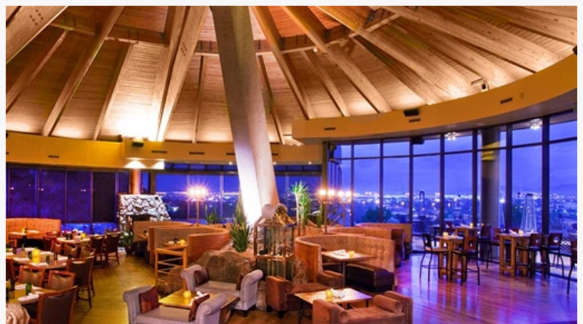
Top of the Rock Restaurant