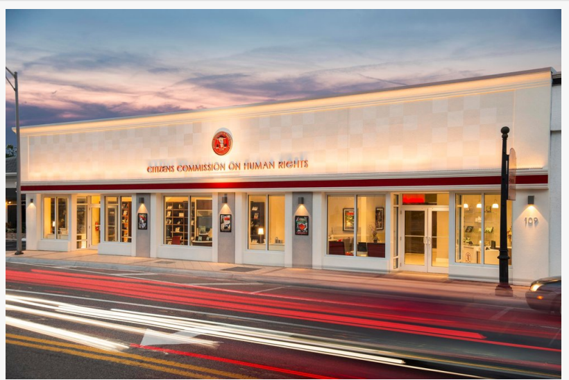
The headquarters for CCHR Florida are located in downtown Clearwater.