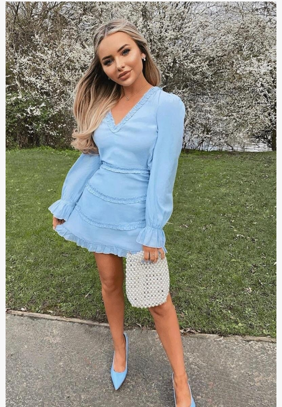
Loveshack Blue Long Sleeve Dress