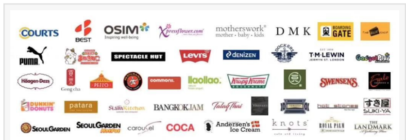
Ronald Aai and Cloud 2.0

Cloud 2.0 members can directly use their Cloud app and utilize their earned CTOs to buy Grab vouchers for the food and other services offered by the Grab platform. Cloud 2.0 members are