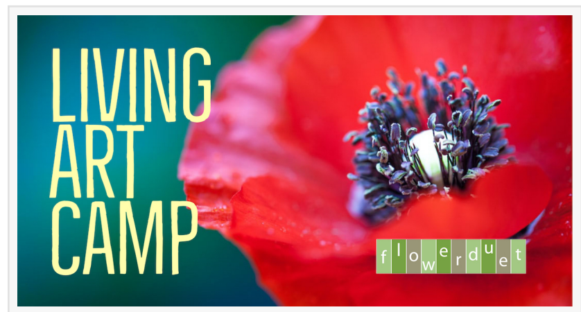
Flower Duet offers new themes each week for its Living Art Camp starting June 22, 2020.

LOS ANGELES, CALIFORNIA, UNITED STATES, June 5, 2020 /EINPresswire.com/ -- For the summer of 2020, Flower Duet wants kids (and their parents) to learn how to make fabulous floral designs, botanical crafts and gain a few entrepreneurship skills, too! Flower Duet's online Living Art Camp weeks will enable anyone to fill