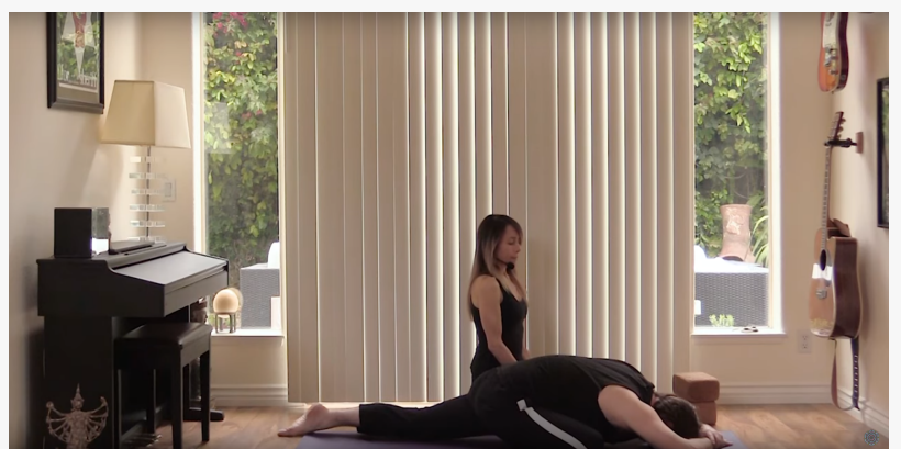
Quarantine Yoga at Home