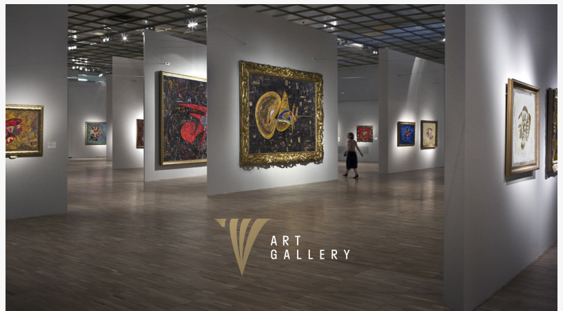
Virtosu Art Gallery

This press release can be viewed online at: https://www.einpresswire.com/article/518806691