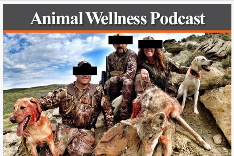
The Animal Wellness Podcast Episode 16

But the practice of killing these animals at WKC continues across America in many other states where thousands of