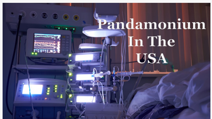
Pandamonium In The USA