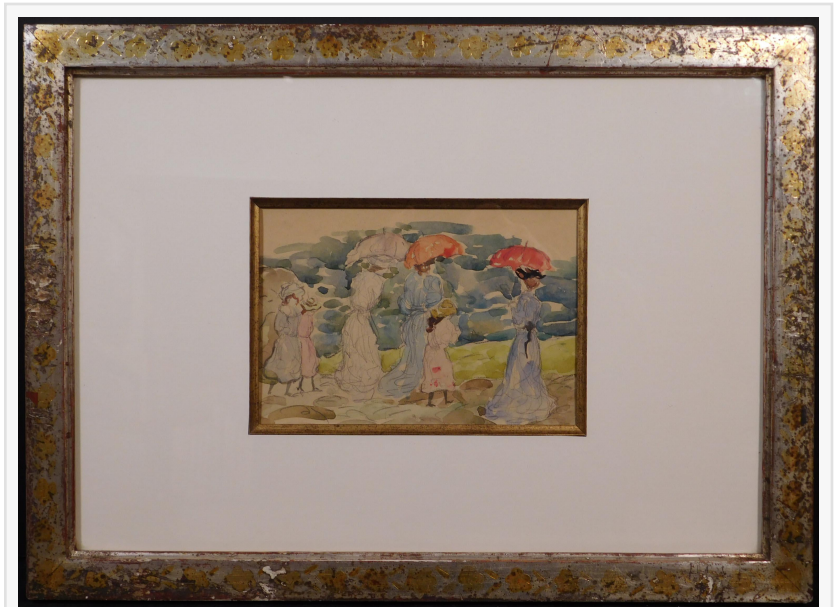
Two watercolor paintings attributed Maurice Prendergast (American, 1858-1924) will come up for bid, to include this lovely framed untitled (Women in a Park) work (est. $20,000-$30,000).