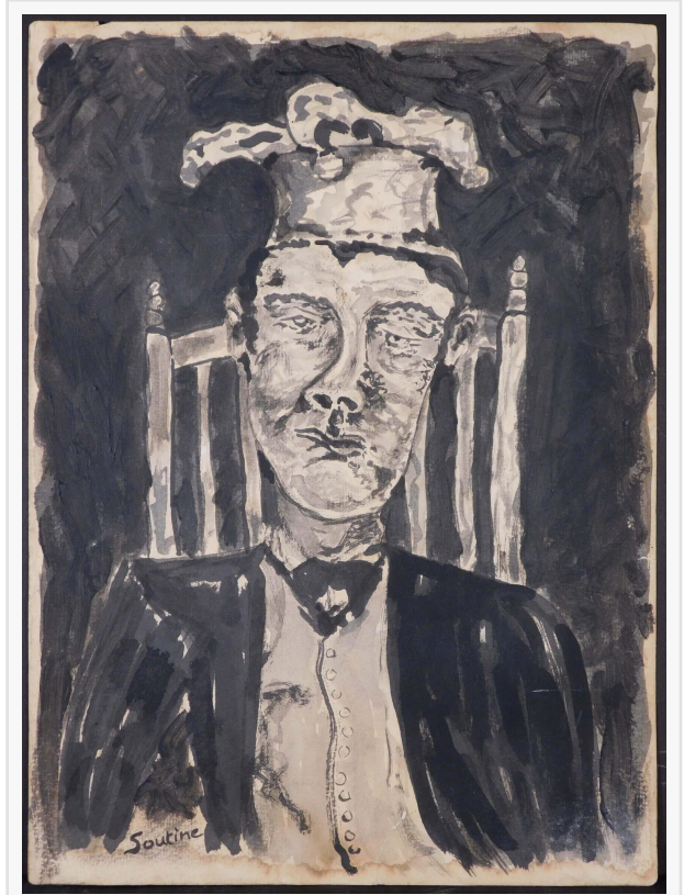
Gouache and ink on paper done in the manner of Chaim Soutine (French, 1893-1943), titled Portrait of a Chef (circa 1932), signed, undated and unframed (est. 10,000-$20,000).

All 153 lots can be viewed in the 500 Gallery showroom, at 1243 Pond Street in Franklin, Mass., by appointment only on Tuesdays and Saturdays. To make an appointment, call 508-834-8190.