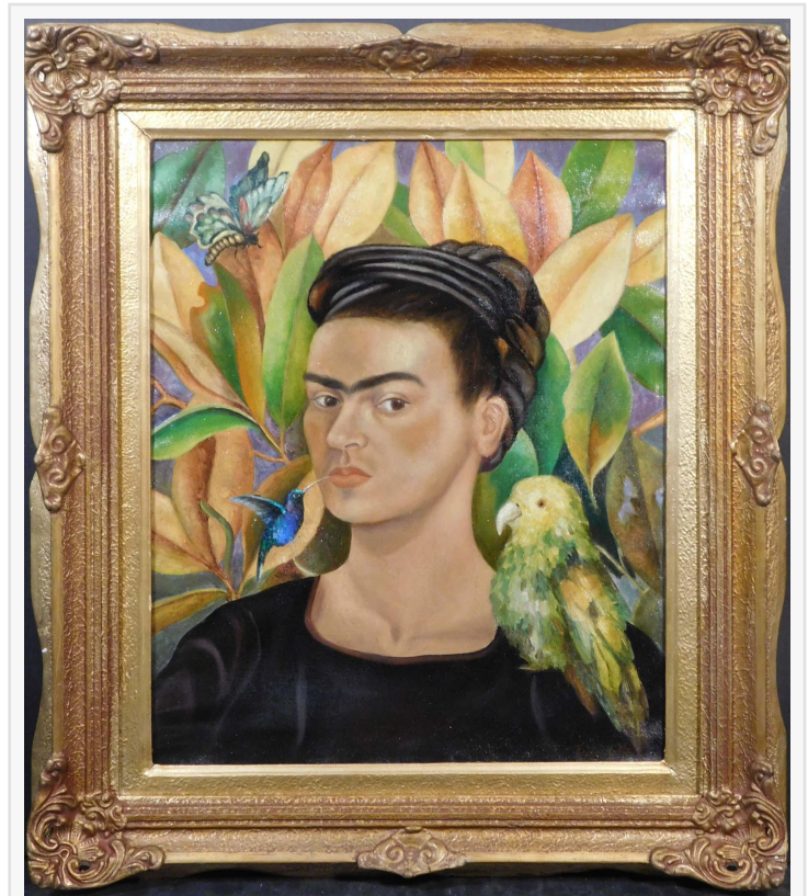
Framed oil on canvas self-portrait done in the modernist style of the iconic Mexican painter Frida Kahlo (1907-1954), depicting the artist with her signature full brow (est. 15,000-$25,000).