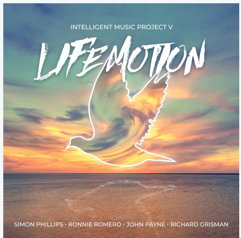
Intelligent Music Project V - Life Motion

“Epidemic, crisis, contagion.” Not a day goes by without hearing these words for more than a month. Indeed, the current situation is a test for everyone, but it also brings some positives - such as the opportunity to spend more time