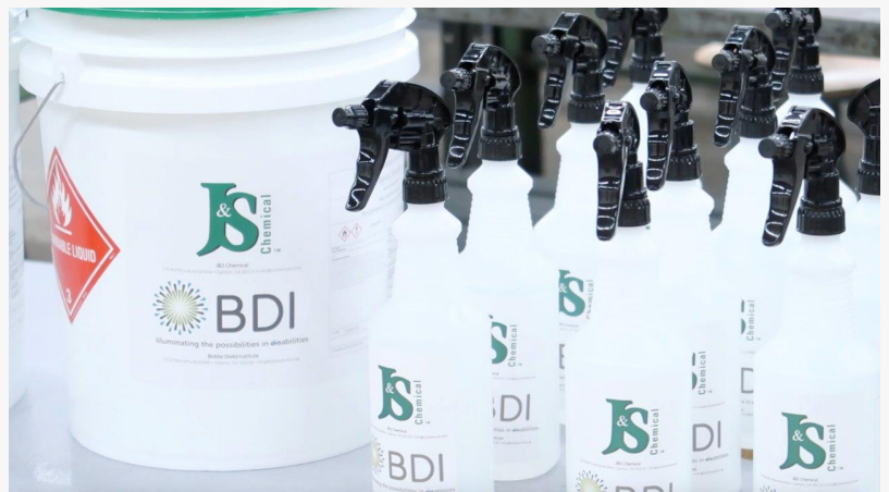
BDI and JS Chemical Hand Sanitizer