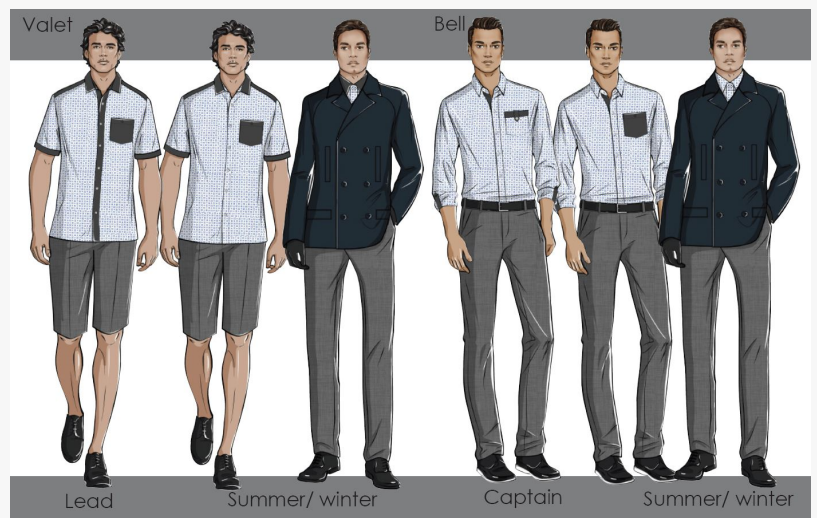
Palms Casino Resort Bell and Valet Apparel Program