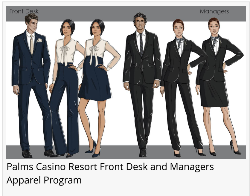
Palms Casino Resort Front Desk and Managers Apparel Program

Design Collective by Cintas created the winning look.