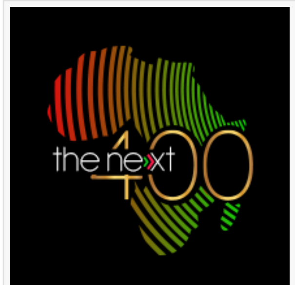
The Next 400 Talk Show Logo