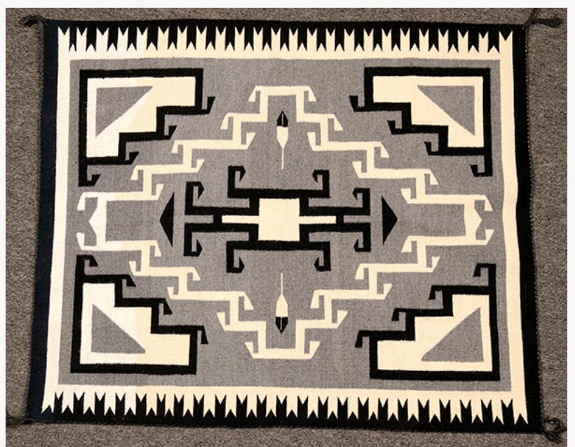
Exquisite Toadlena Two Grey Hills (New Mexico) weaving, 42 inches by 36 inches, in excellent condition, with the four corners hooked, as is the center diamond (est. $1,500-$3,000).

Day 3, on Saturday, June 27, will showcase minerals and native gold nuggets and rarities, mining artifacts from an old collection, mine maps, Native Americana (to include rugs, art, jewelry and references such as a Chinook Directory, cowboy collectibles, the previously mentioned Norman Rockwell early signed prints, and bottles and saloon items from various Western collections.