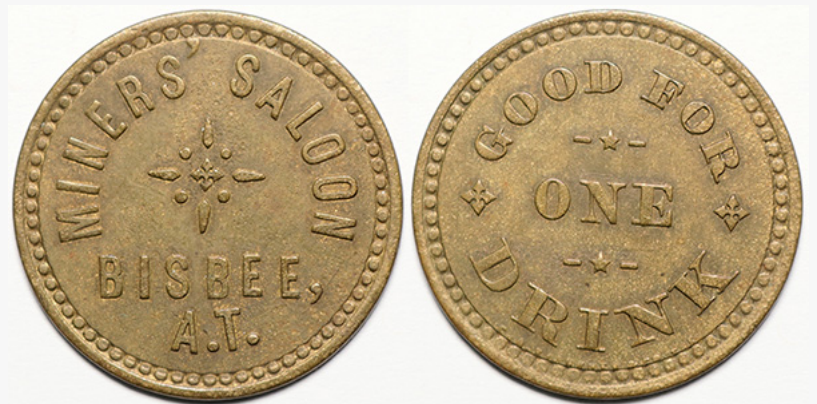
Token from the Miner's Saloon in Bisbee, Ariz. (1880s, est. $600-$1,000). The Miner's Saloon was quite popular and Bisbee was once the largest city between New Orleans and San Francisco.