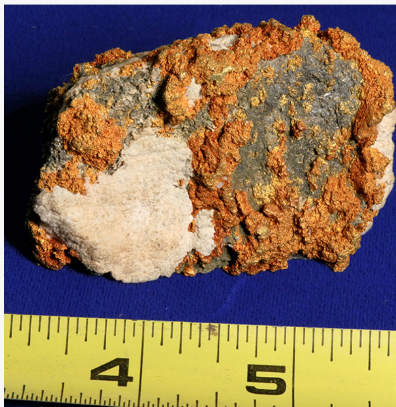
Large native crystalline gold in quartz specimen with lead and silver sulfides, mined in the 1950s and in need of professional curation, weighing 12.32 troy oz. (est. $10,000-$14,000).