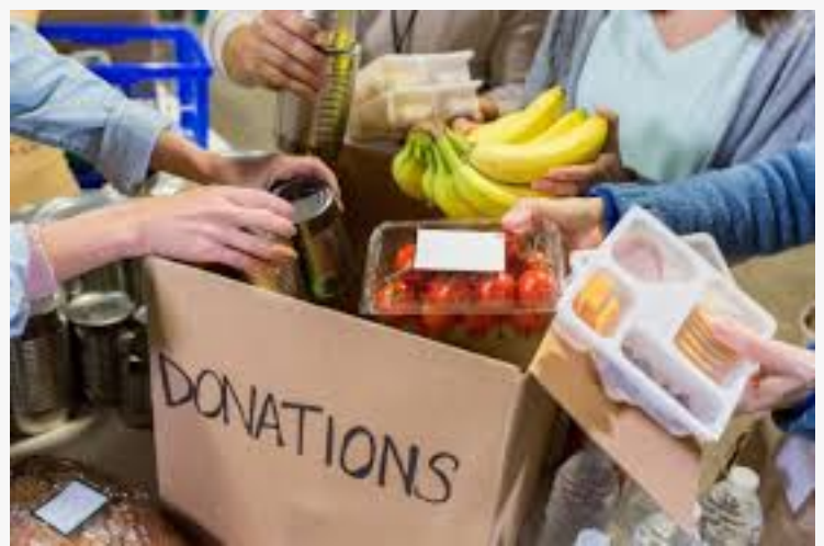
Food Bank Replenishment Donors

Food banks and pantries along with soup kitchens and other groups designed to help keep those in need fed are another major charity type, and they require ongoing donations to stay active.