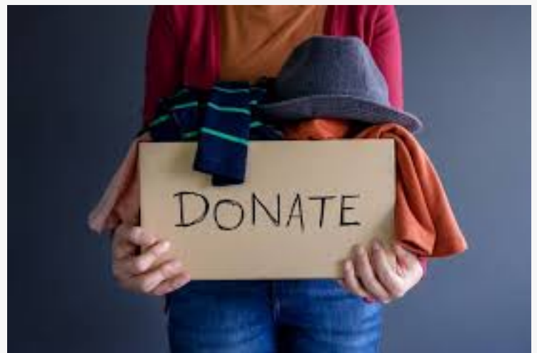
Deep Pocketed Generous Donors

Donor mailing lists need to connect organizations to those who are actually receptive to and more likely to make donations to those who need them. The lists from Sprint Data Solutions allow organizations to save time and money when seeking donations, improving their operational efficiency and their ability to help those in need.