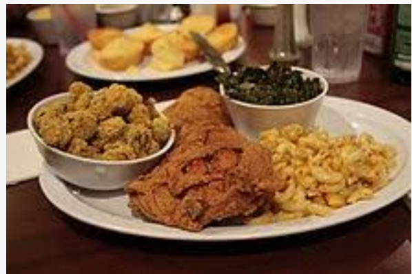
Soup Kitchen Donors