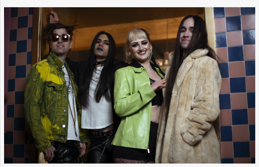
Makes My Blood Dance