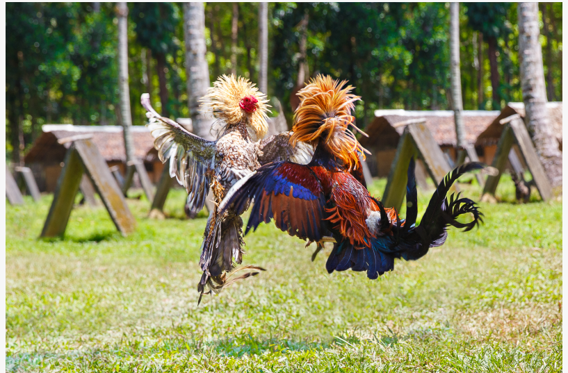
Cockfighting that runs rampant in Alabama

BIRMINGHAM, ALABAMA, USA, June 16, 2020 /EINPresswire.com/ -- The Animal Wellness Foundation (AWF) and Animal Wellness Action (AWA) today announced a $5,000 reward for information resulting in successful prosecution of any individual for violating the federal law (7 U.S.C. § 2156) against animal fighting. The announcement follows last week's release of AWA and AWF's cockfighting investigation results in the Yellowhammer State and formal request to the U.S. Attorneys for the Northern and Middle districts to investigate massive trafficking of fighting animals from Alabama to foreign countries activities.