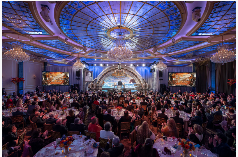
Writers of the Future Event 2019

LOS ANGELES, CA, USA, June 17, 2020 /EINPresswire.com/ -- The L. Ron Hubbard Achievement Awards Ceremony, celebrating its 36th anniversary of the internationally-acclaimed Writers of the Future Contest and its companion Illustrators of the Future Contest, will be held as a combined event with the winners for the 37th anniversary on April 16, 2021. The change was done to accommodate the current international travel restrictions, thus enabling all Contest winners to be properly honored.