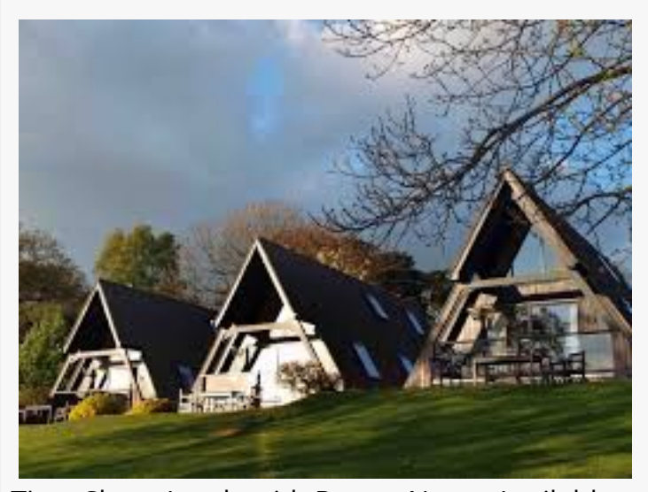
Time Share Leads with Resort Name Available

company was the result of a decision to turn from serving the country to serving the businesses of America through mutually beneficial partnerships. Sprint Data Solutions Worldwide first started in its home territory of Las Vegas, Nevada, and the staff members have over 50 years of collective marketing experience.