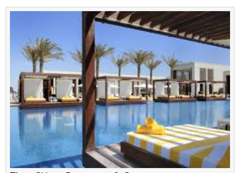
Time SHare Prospects & Owners

Sprint Data Solutions And Their Story Sprint Data Solutions Worldwide Marketing is owned and operated by a veteran. The