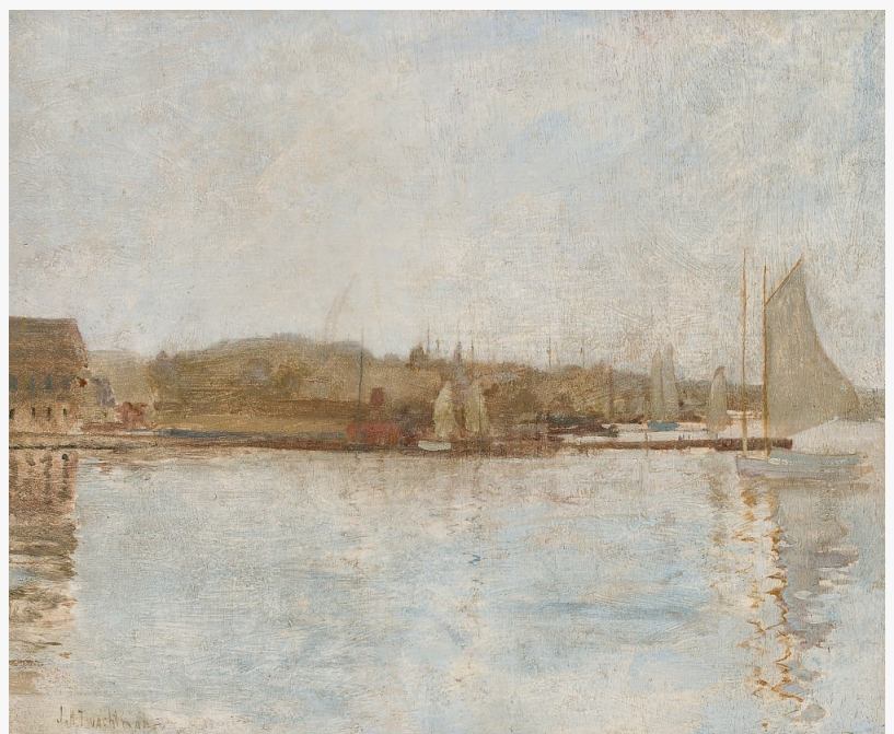
Lot 73 – John Henry Twachtman (American, 1853-1902), A View of Greenwich Harbor , oil on board, signed, 15 1/2 x 18 1/4 inches, estimate: $20,000-$30,000.