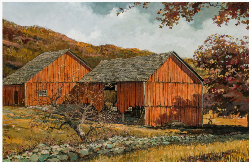
Lot 17 – Eric Sloane (American, 1905-1985), The Red Barn, oil on Masonite, signed, 23 1/4 x 35 1/2 inches, estimate: $10,000-$15,000.

This press release can be viewed online at: https://www.einpresswire.com/article/519703778