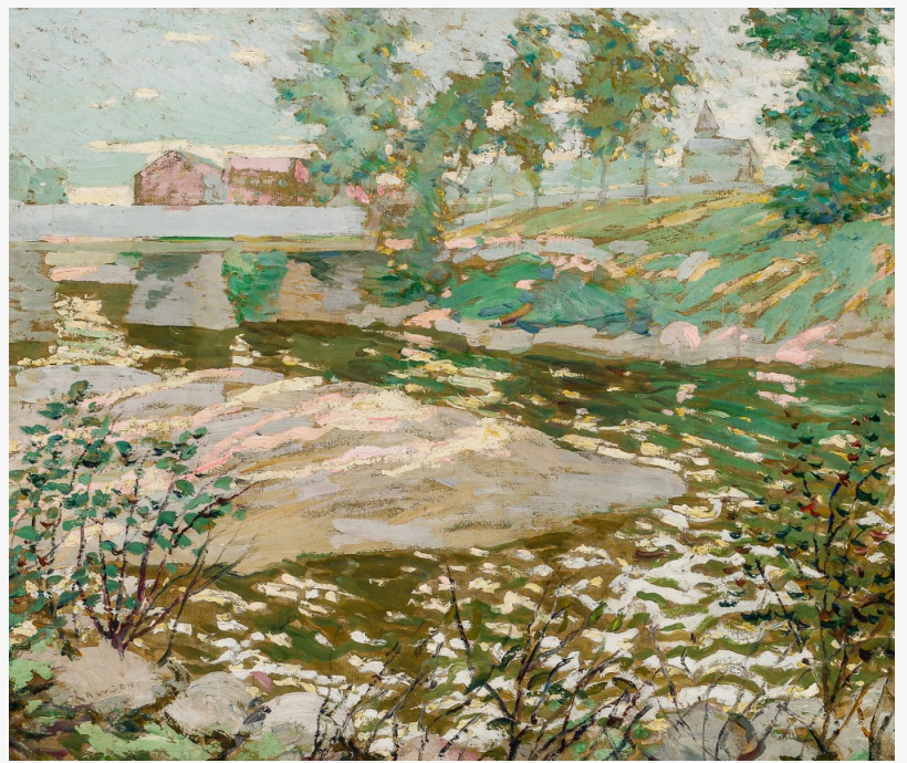
Lot 38 -Ernest Lawson (American, 1873-1939), A View of the Bronx River, oil on canvas, signed, 20 1/4 x 23 inches, estimate: $15,000-25,000.

Sandra Germain Shannon's Fine Art Auctioneers +1 203-877-1711 email us here