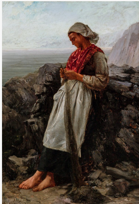
Lot 45 – Jules Breton (French, 1827-1906), Mending the Nets, oil on canvas, signed lower left "Jules Breton", 26 1/4 x 18 inches, estimate: $30,000-50,000.