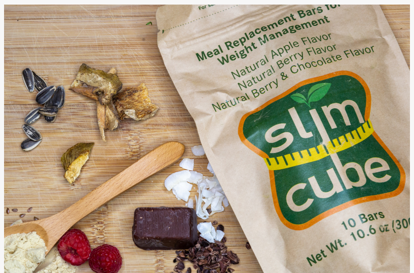
Slim cube Quality Packaging and ingredients