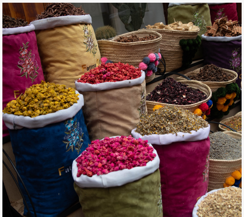
Slim cube Uses The Finest Raw Materials

We track important data that most companies peddling weight loss products miss like; the participant's weight loss, actual results, energy levels, improved sleep and general feeling of well-