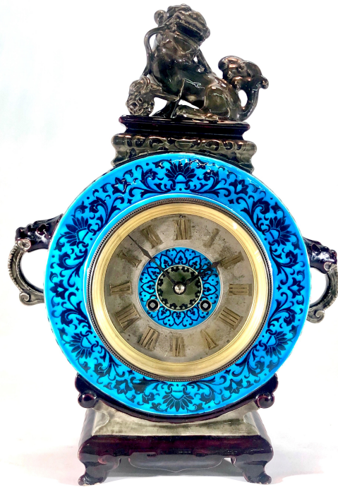
Continental glazed earthenware chinoiserie mantel clock, 15 3/4 inches tall by 11 3/4 inches wide (est. $600-$800).