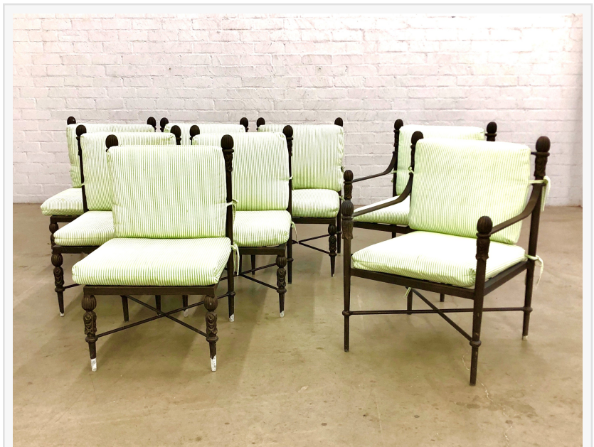
Suite of Michael Taylor 'Montecito' modern garden furniture, comprising a dining table and eight side chairs (est. $1,500-$2,000).

Antiques to modern design and everything in between will be on offer in the sale, such as an Ormeaux bowl by René Lalique (est. $400-$600). Decorative arts and furniture will be highlighted by a Continental glazed earthenware chinoiserie mantel clock (est. $600-$800), a suite of Rose Tarlow 'Twig' furniture (est. $400-$800) and a Ceccarelli Majolica and iron table (est. $500-$800). Also included will be a La Cornue Château Series range (est. $3,000-$5,000).