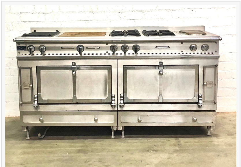
La Cornue Château Series range, 40 inches tall by 71 inches wide by 29 inches deep (est. $3,000-$5,000).

Aileen Ward Andrew Jones Auctions +1 213-748-8008 email us here