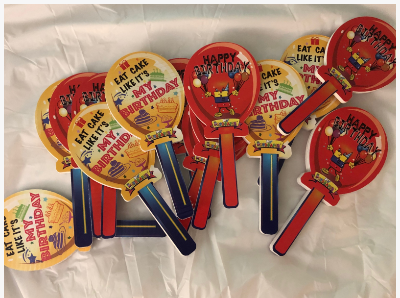
The Fun Birthday Party Accessory

LOS ANGELES, CALIFORNIA, UNITED STATES, June 19, 2020 /EINPresswire.com/ -- Def Beat Entertainment Inc. today announced Fan-A-Cake , a new PPEE-Party Protecting Entertainment Equipment. Fan-A-Cake is a fun festive device that sole purpose is to eliminate airborne germs expelled when blowing out the candles on a cake at any celebration. It offers a new way for moms and event planners and dads coordinating parties to provide an extra layer or caution to the cake celebration tradition.