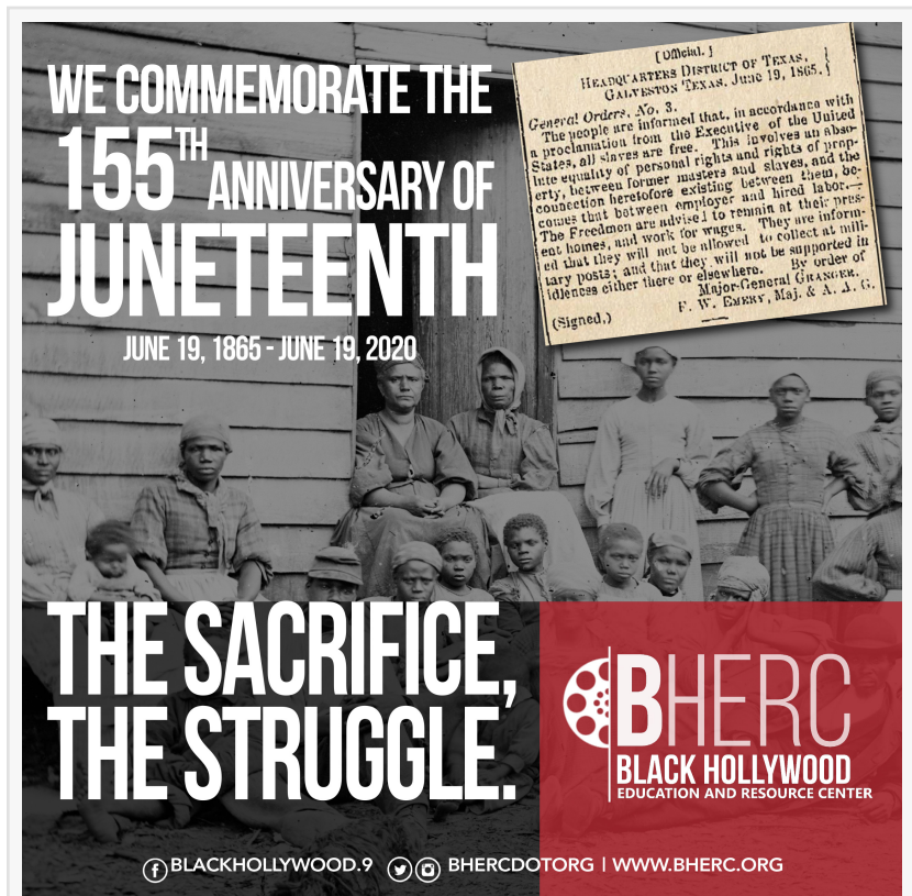
BHERC Commemorates Juneteenth Father's Day Weekend