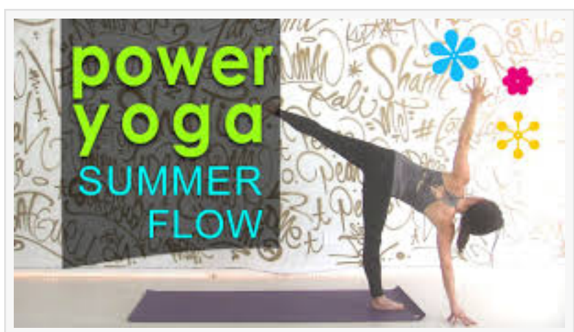
Power yoga for Summer / Summer Yoga Workout 2020

Through the years, Heart Alchemy Yoga has grown to become a leading YouTube channel in Power Yoga classes