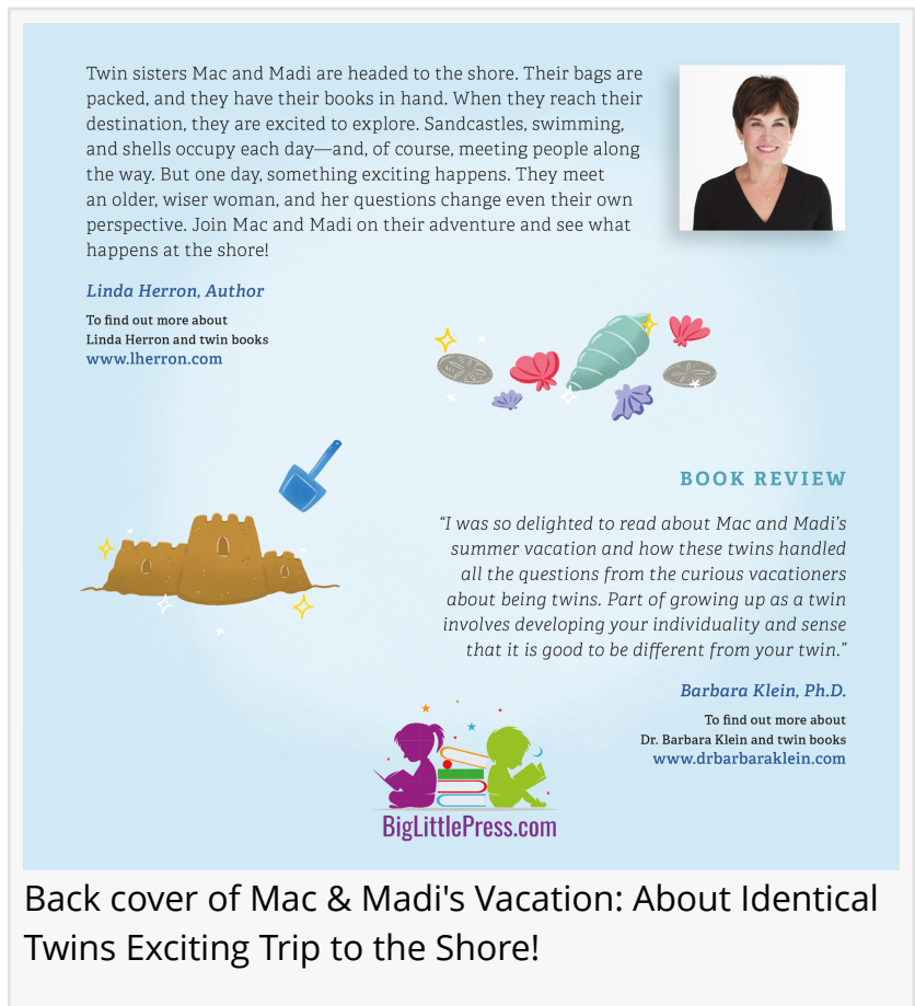
Back cover of Mac & Madi's Vacation: About Identical Twins Exciting Trip to the Shore!