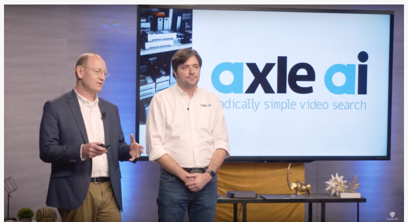
Axle AI cofounders pitch on Meet the Drapers

/EINPresswire.com/ -- axle ai , a company that develops software that helps media teams work remotely, is appearing on Sony International's Meet the Drapers, a show hosted by veteran venture capitalist Tim Draper. The episode, in Meet the Drapers' 3rd season, is now viewable online at http://tinyurl.com/axledraper . The company's equity crowdfunding offering on Republic has now raised over $75,000, 300% of its original target. It ends at Midnight Pacific time on Tuesday June 23rd.