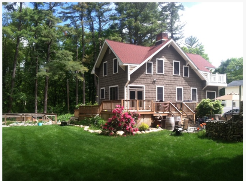
A typical dark green Pearl's Premium lawn saves time, money and water

Dark green and barefoot soft, Pearl's Premium Ultra Low Maintenance Lawn Seed emits 24 times the oxygen compared to Bluegrass. An oxygen rich environment helps improve your general health & helps you feel happier / calmer during unusual or stressful times like now. Dark green it is peaceful for your eyes. Realtors say that having a nice lawn improves the value of your property by 15%. This kind of lush lawn is uplifting for your spirit & with the extra oxygen your lungs will thank you! This is a healthy, sustainable, money and water saving lawn that looks like