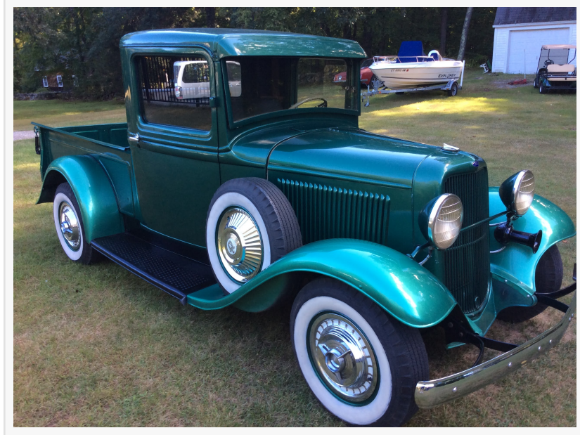
1933 ford pickup

The auction will also feature two furniture pieces from New York furniture maker RJ Horner. One is a hand-carved mahogany partners desk, and the other is an oak glass breakfront that could be used as a back bar, or to display china, books or curio collections. The breakfront is