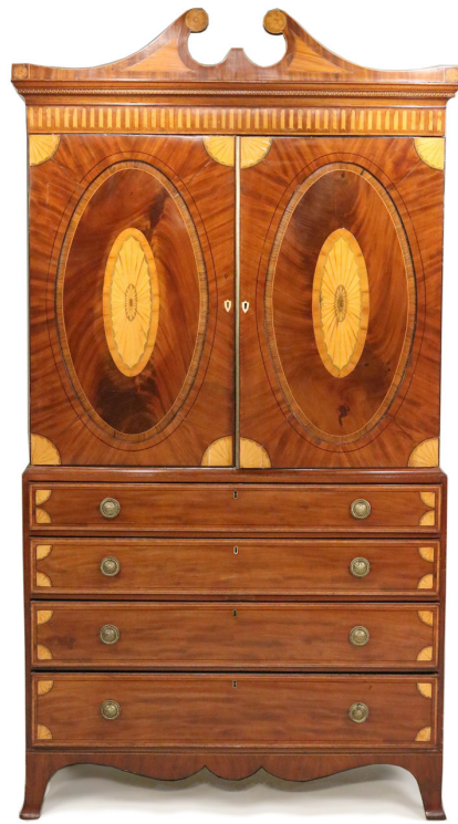
George III inlaid Mahogany Linen Press, English, late 18th century.

For more information about Nye & Company Auctioneers and the Estate Treasures online only auction on Wednesday, July 8th, visit www.nyeandcompany.com . The full color catalog can be