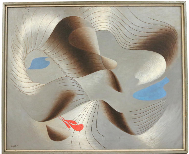
Oil on Canvas by Herbert Bayer (American, 1900-1985) titled Convolutions in Grey.