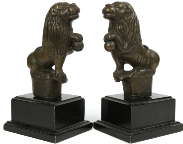
Pair of North German bronze lions from the late 15th century.