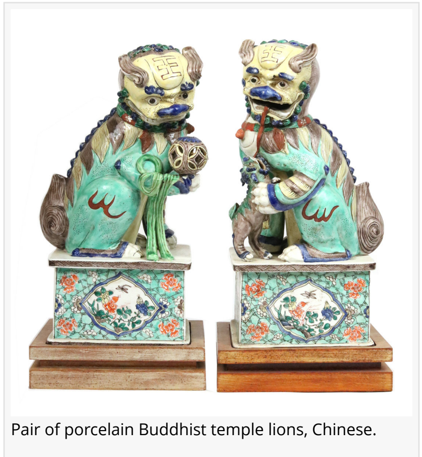
Pair of porcelain Buddhist temple lions, Chinese.