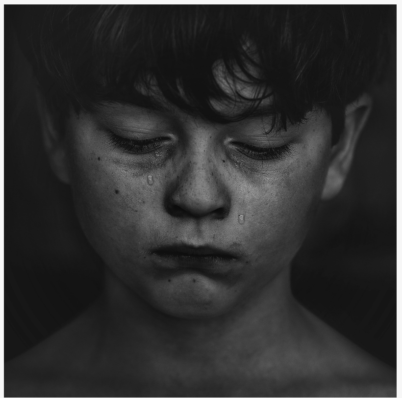
It was reported during the Baker Act Task Force that an estimated 30% of the children being Baker Acted in Pinellas County alone did not meet the criteria.

Under the Baker Act, a person, no matter their age, can be taken into custody for an involuntary psychiatric examination. This includes children and during 2017-2018 there were a staggering 36,078 involuntary psychiatric examinations initiated on children across the state with over 4,000 of these Baker Acts involved children 10 and younger. [7]