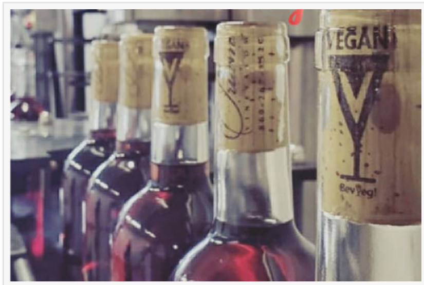
Cheers to BevVeg Certified Vegan Wines