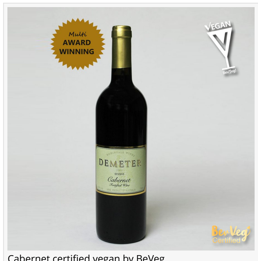
Cabernet certified vegan by BeVeg

BeVeg vegan certification lends transparency to consumers who wants to know what is in their glass. Many do not realize that wine, beer, and liquor are often filtered through or made with animal parts like isinglass (fish bladder), gelatin (animal bones), and egg whites to name a few.