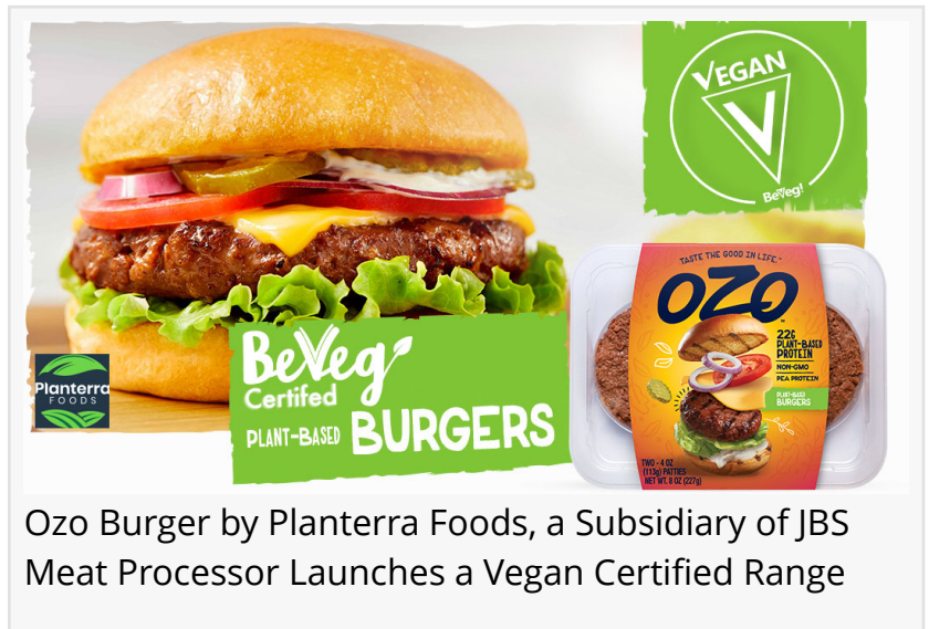
Ozo Burger by Planterra Foods, a Subsidiary of JBS Meat Processor Launches a Vegan Certified Range

with transparent, straightforward and no artificial ingredients, that is soy-free and verified vegan by BeVeg International, the leading global vegan certification firm. Powered by an exclusive proprietary blend of pea and rice protein fermented by shiitake mushrooms, all of the new OZO™ products are an excellent source of protein (with up to 22 grams per serving). They contain no cholesterol and less calories, fat and saturated fat than 80% lean ground beef, as well as other leading plant-based protein brands currently in the market. OZO™ features a high-quality pea protein that is a great source of iron, and has been known to aid in muscle growth,