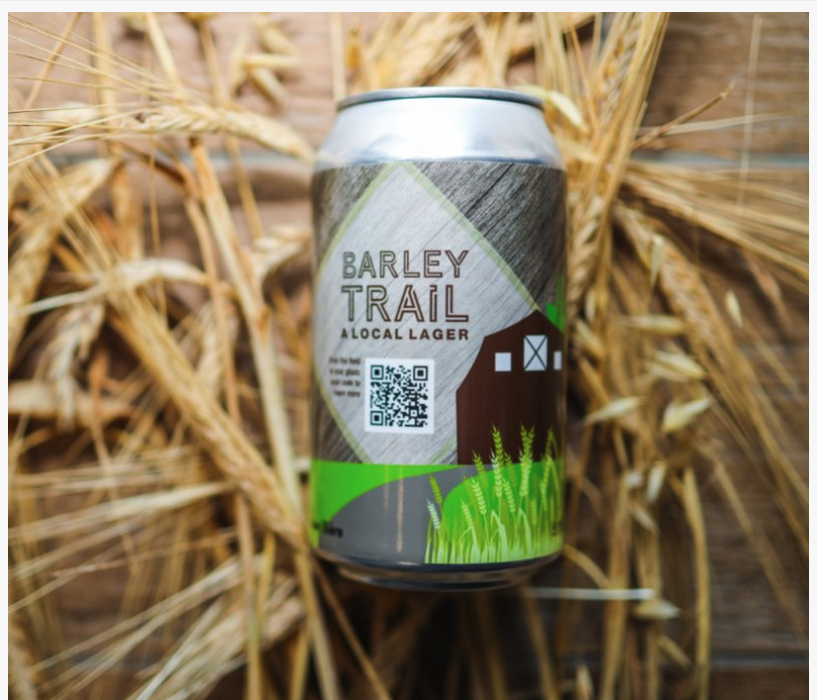
Barley Trail - The last mile of the journey!