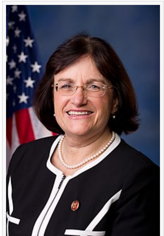
U.S. Rep. Annie Kuster (D-NH)

The Animal Wellness Foundation (Foundation) is a Los Angeles-based private charitable organization with a mission of helping animals by making veterinary care available to everyone