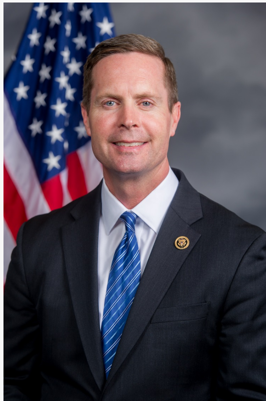
U.S. Rep. Rodney Davis (R-IL)