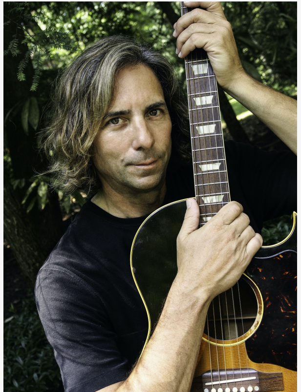
Nuke The Soup

Sea level and mountain summits: how much farther apart, how much more different, could anything be? Nuke The Soup's new rocker, with its driving, upbeat jangle and organ, begs to differ: "But whatever paths we roam / Or where we choose to call home / I'll pursue having you by my side." It's a big, beautiful track that crackles with the courage of conviction, keeping it joyous, as though sung from atop a surfboard rather than a soapbox. There are subtle layers of additional instrumentation throughout, everything existing in perfect harmony, thanks in part to a stellar mastering job by Grammy-winner Bob Ludwig (Nirvana, Springsteen, Radiohead). "Oceans and Mountains" is the closer on a record that The Daily Vault calls "a sophisticated,