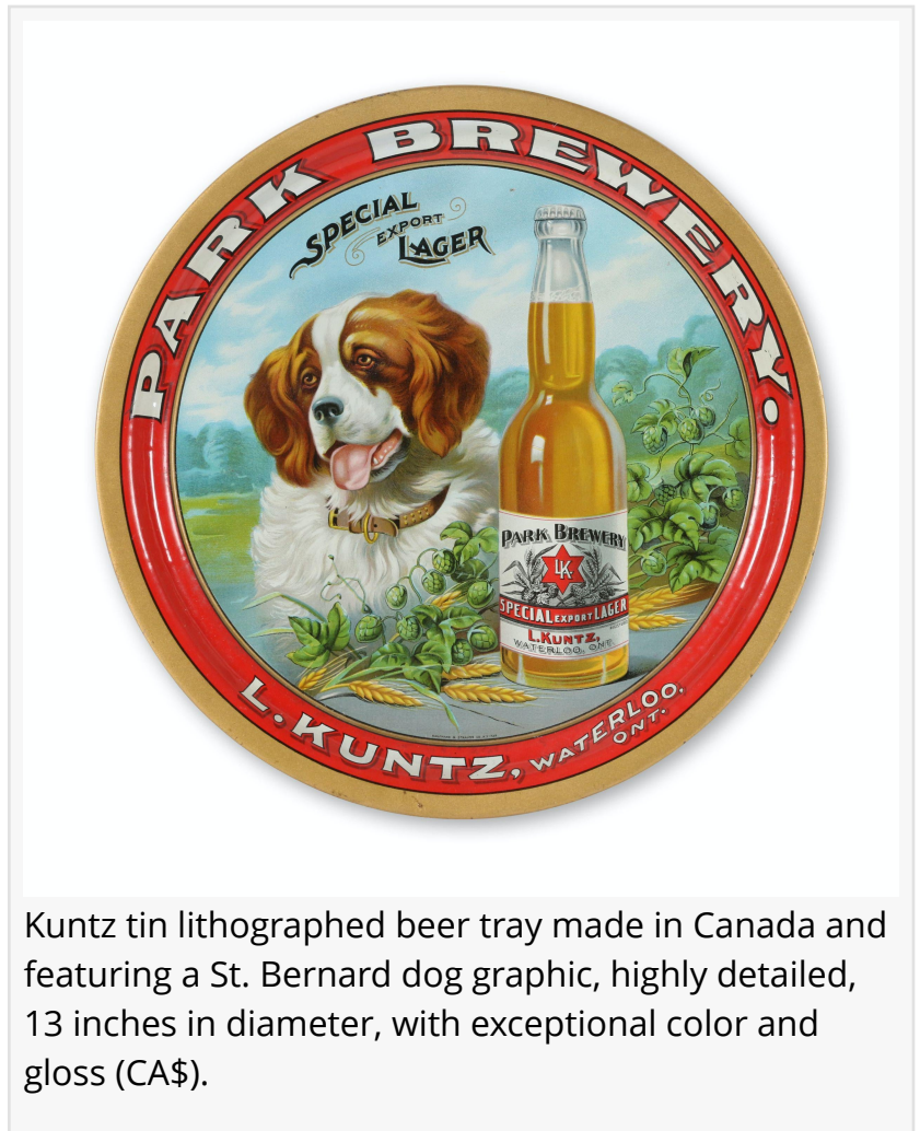
Kuntz tin lithographed beer tray made in Canada and featuring a St. Bernard dog graphic, highly detailed, 13 inches in diameter, with exceptional color and gloss (CA$).