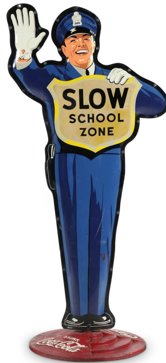
American Coca-Cola school policeman sign from the 1950s, 60 inches tall, the "fishtail" logo version, two lithographed metal panels standing on a cast metal base (CA$3,900).

Ethan Miller Miller & Miller Auctions, Ltd. +1 519-573-3710 email us here